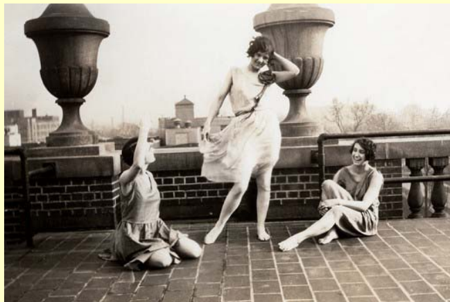
Pictured: HFH School of Nursing dancers c.1927